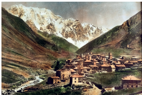
Photo 2: Reproduction of an undated photograph from the 1960s, showing Chvibiani and Zhibiani and taken from a room of the Solomon guest house in Chvibiani, which captures the principal phase of reconstruction during the Soviet period. Older interlocutors have stated that during this phase, over half the village's uninhabited towers were demolished for building materials.