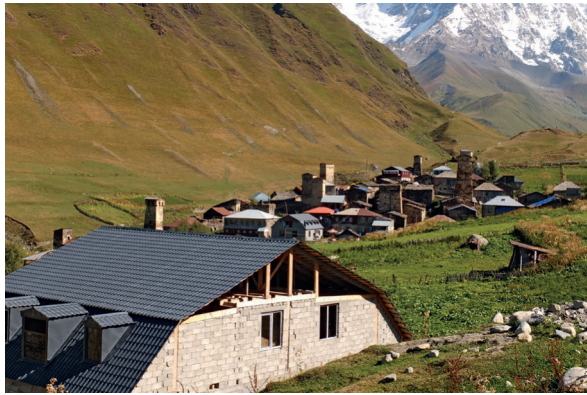
Photo 4: The new building in the foreground is a café and restaurant for tourists constructed in a European Alpine style