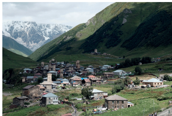
Photo 3: The same view, taken in 2018; a check at the site confirms that since the previous photograph was taken, only one further tower has been lost, to collapse.

elled on hotels and other types of tourist-oriented structures typical of the European Alps (cf. Photo 4 and Photo 5). Further, seasonal returners to Ushguli, who cannot do the work of mountain farmers, do not meet UNESCO stipulations as regards contributing to the preservation of the local cultural landscape (cf. criterion V, ICOMOS 1996).