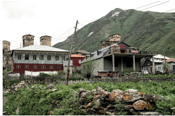
Photo 5: A 1960s residential building, whose core dates from the medieval period and which has been transformed from its original shape by processes of renovation and extension

(2) ‘permanent returners’ who resettled in the community in response to the economic crises since the late 1990s, initially to subsist and later, after around 2010, in order to develop a sustained livelihood from services to tourists; (3) ‘intermittent returners’, who live in Ushguli during the summer months only and have converted their properties and farms to guest houses (see also VOELL et. al. 2016).