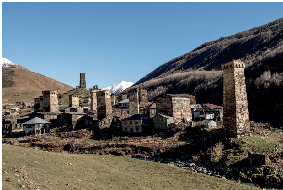
Photo 1: View of Chazhashi, a current World Heritage site which in the Soviet era was known as the Ushguli-Chazhashi Museum Reserve and held protected status from 1971 onward.

UNESCO's rationale for awarding World Heritage status and the current situation on the ground. The risk exists that UNESCO could, as it has in other cases, reduce the geographical extent of Georgia's World Heritage sites or remove the status from an entire architectural ensemble (cf. STADELBAUER 2018, 47f). Populations in remote mountainous areas, likewise in regions of the Caucasus, generally perceive the rich cultural and ecological heritage frequently found in such areas to hold significant potential for the development of tourism from hikers and culture aficionados (cf. GRACHEVA et al. 2012). In Ushguli, it appears as if this promise may be at risk of radical reversal due to the threat to the cultural landscape's long-term survival.