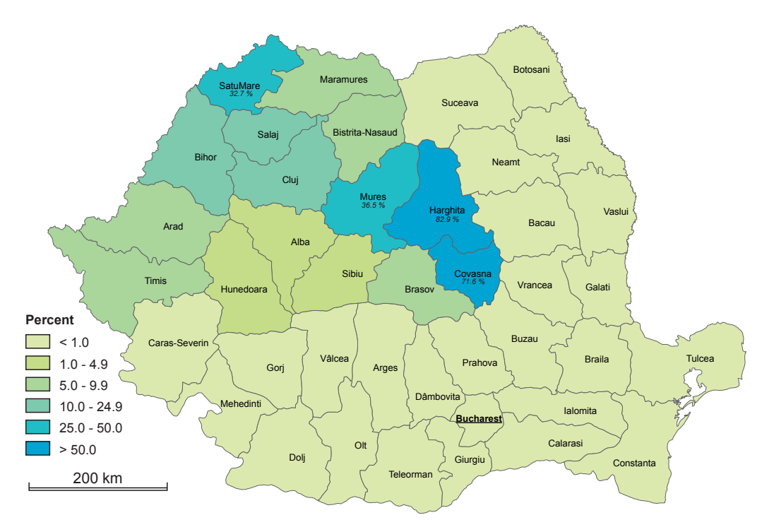
Fig. 3: Romanian residents identifying as Hungarian as a percentage of county populations