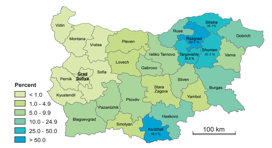
Fig. 1: Bulgarian residents identifying as Turkish as a percentage of county populations