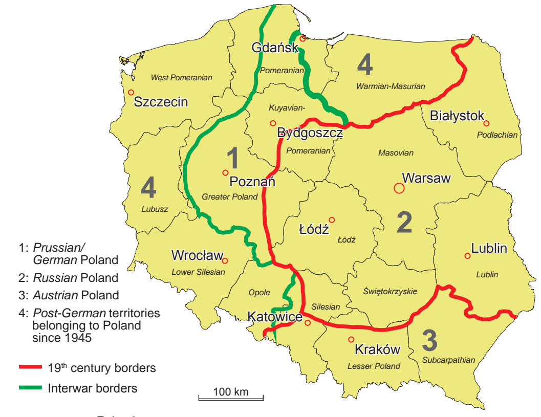
Fig. 1: Voivodeships of Poland and historical borders

ally opt for liberal/social democratic parties and candidates (so-called liberal Poland , in Polish Polska liberalna ), the central and eastern provinces are dominated by conservative voters (so called solidary Poland , in Polish Polska solidarna <sup>2)</sup>). The borders (usually very sharp) of the indicated splits (not) surprisingly correspond with the historical borders within the Polish state: the nineteenth century boundaries of Prussia/Germany, Russia and Austria (JANICKI et al. 2005). Additionally, post-German territories are also visible in this puzzle.