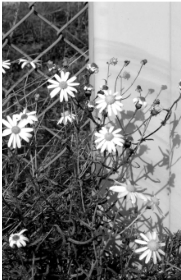
Photo 1: Senecio inaequidens DC. in Fuerth/Bavaria (near Nuremberg, 2001)

Population growth is in any case not possible if the descendants do not find suitable sites for establishment in the vicinity of the founder individuals. For S. inaequidens , the preference of anthropogenic sites has led to